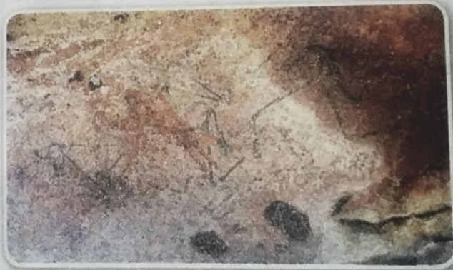
Prehistoric Rock-Painting of Bhoranwali, Bhimbetka (Upper Palaeolithic Period)

Mesolithic Period. The paintings of this period are comparatively small in size but more in numbers. There is the depiction of communal dancers, birds, human playing musical