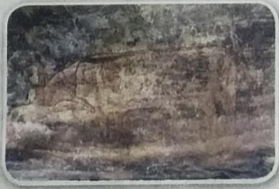
Big size animal

Upper Palaeolithic Period. In this period, the big size figures of animals such as bison, tigers, rhinoceros, boars and stick-like human figures had been delineated on the wall of the caves in green and dark red in which a few are wash paintings and mostly in geometric patterns. The dancers were painted in green and hunters in red.