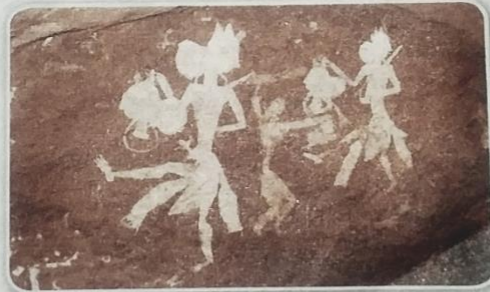
Dancing Girls, Panchmarhi, M.P.

Early History Period. The paintings of this period are schematic and decorative in style and painted mainly with red, white and yellow colours. The association of riders, depiction of religious symbols as figures of Yakshas, tree, gods and magical sky chariots are worth seeing.